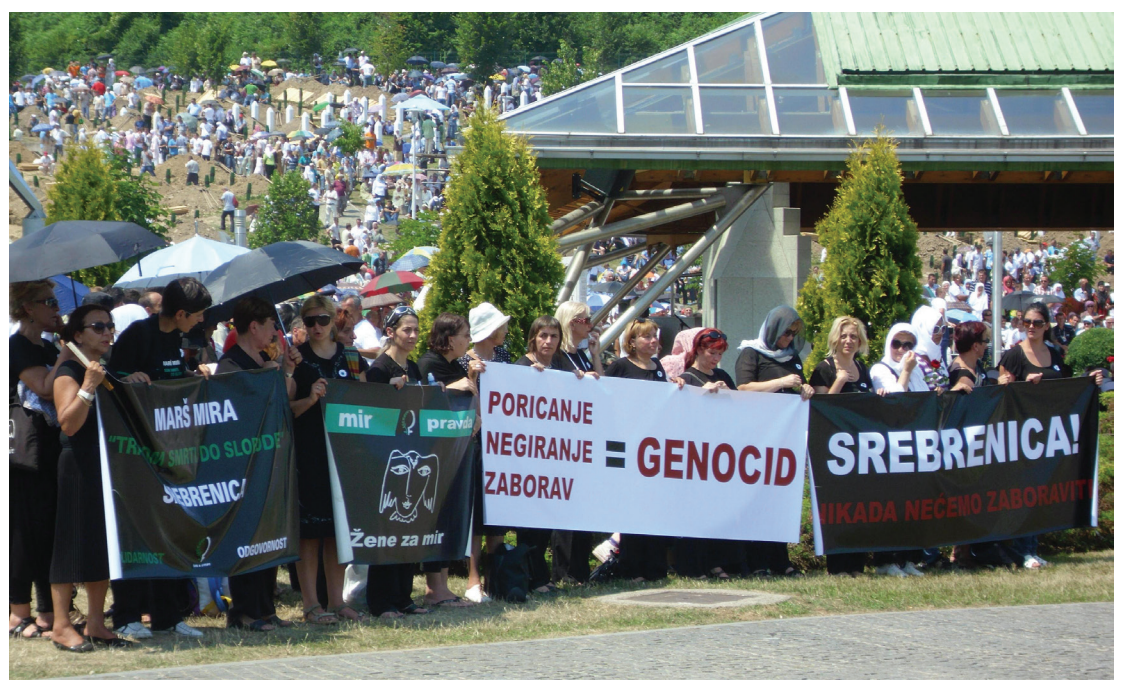
Members of Women in Black, a peace and justice organization, attend a memorial service, held every year in Srebrenica, Bosnia-Herzegovina, July 2011.