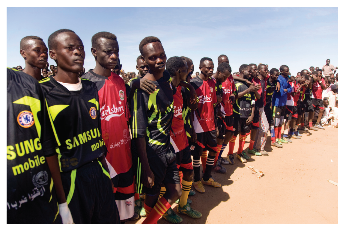
Sudanese football teams play football as part of campaign 'We Can End Violence Against Women', organised by African Union-United Nations Hybrid Operation in Darfur (UNAMID) and the United Nations Population Fund (UNFPA), Abu Shouk Internally Displaced Persons Camp, North Darfur, 2009.