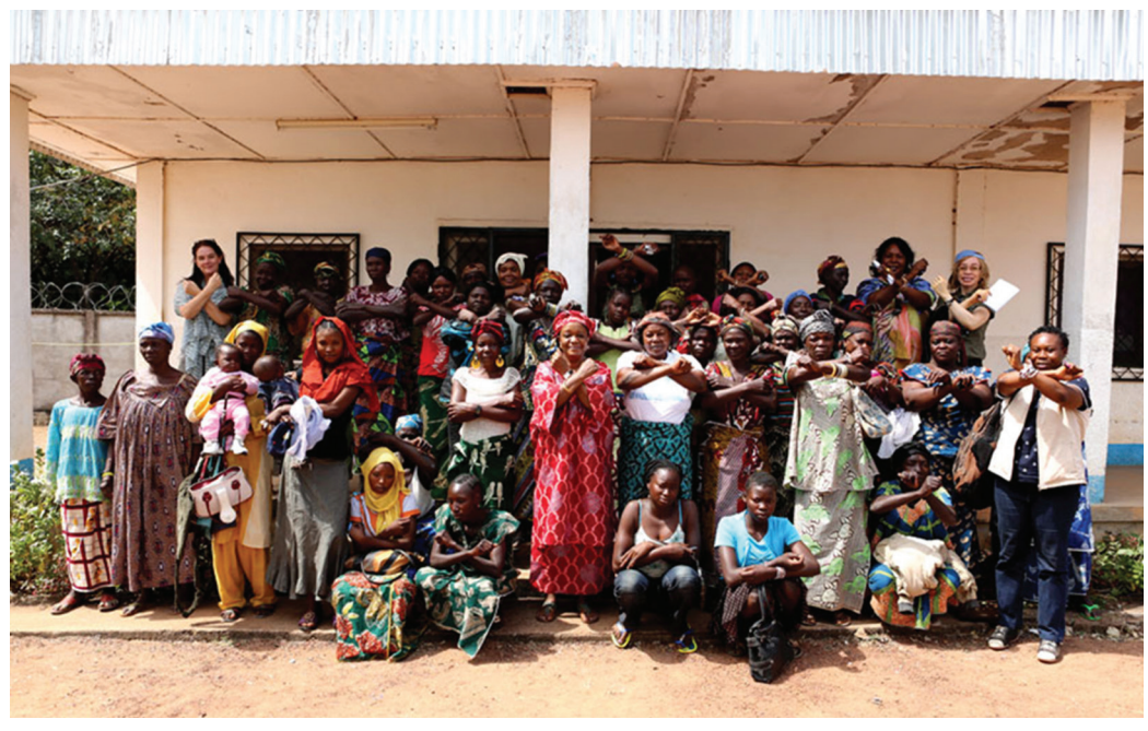
A women's group in Cental African Republic joins UN Special Representative on Sexual Violence in Conflict, Zainab Hawa Bangura, in the 'stop rape in war' campaign.